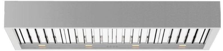
Optional -- Proud Mount Cradle -- X1CB15 (150cm)